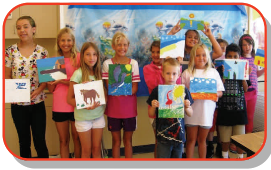
Over 100 children attend our arts camp each year to discover their artistic talents through professional instruction and hands on experience!

CAMP FEE: $100. BUS TRANSPORTATION (from Pocomoke & Snow Hill): $15.