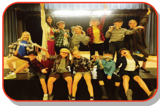
Campers express themselves through performing arts.

Be a pART of ART this Summer! Learn from experienced instructors, create exciting projects, make lifelong friends!